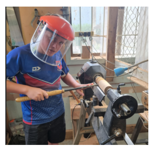
Should you have your eyes on the wood Oran?