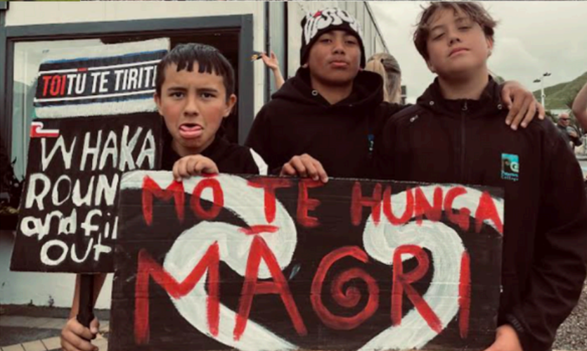
Toitū te whenua! Toitū te moana! Toitū te Mana Māori Motuhake!