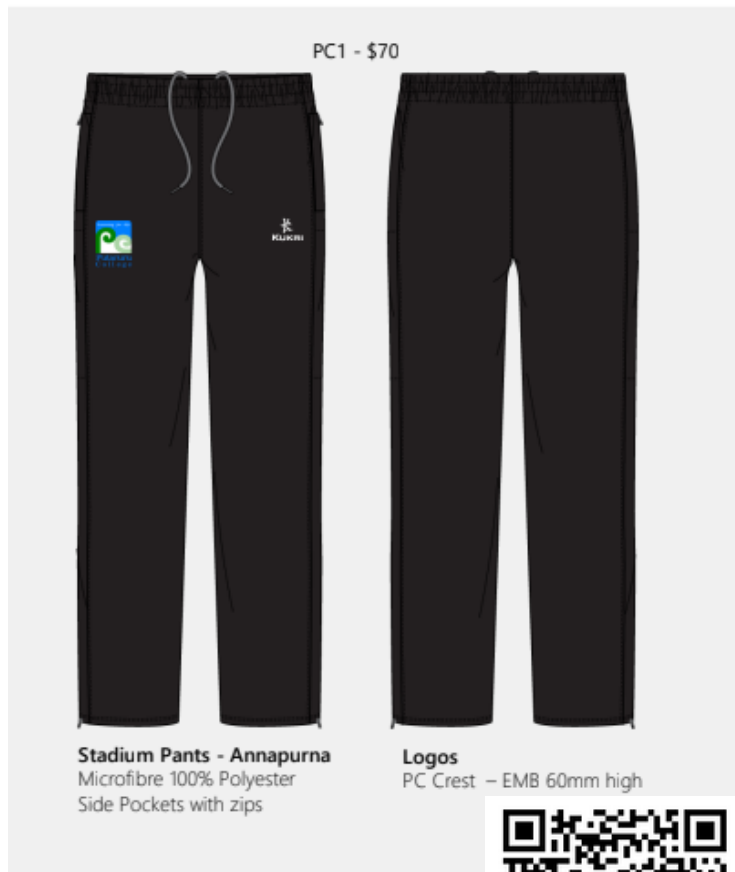
PC1 - $70