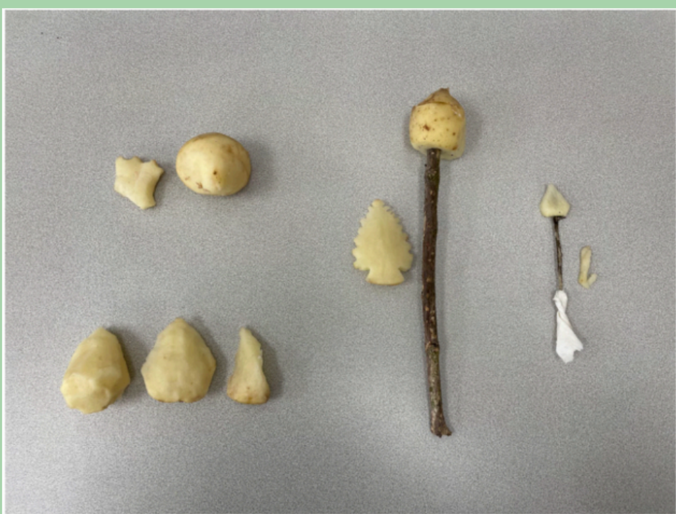
Top left: Oldowan tools, made with very few strikes. Bottom left: Acheulean hand axes. Right: Mousterian tools may include notched edges or the mixing of materials to make tools such as spears. Far right: Upper Paleolithic tool culture includes more intricate tools such as fish hooks.