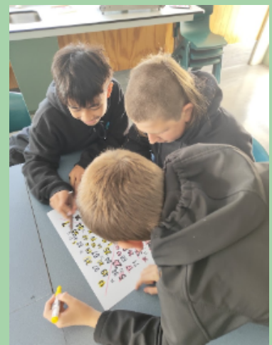
3 Rocketers working collaboratively to solve problems!