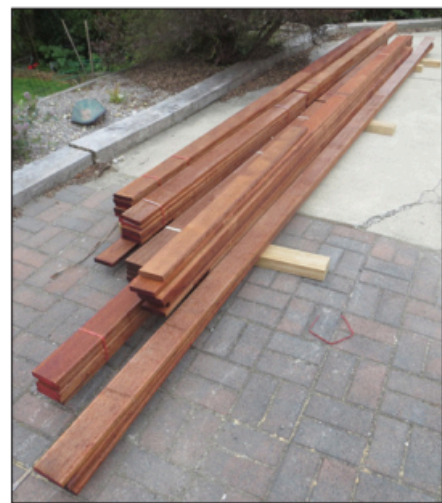
Linear metres of decking wood