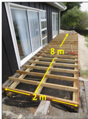
Deck measuring 8 metres \times 2 metres

Tui says that about 190 linear metres are needed to build the deck.