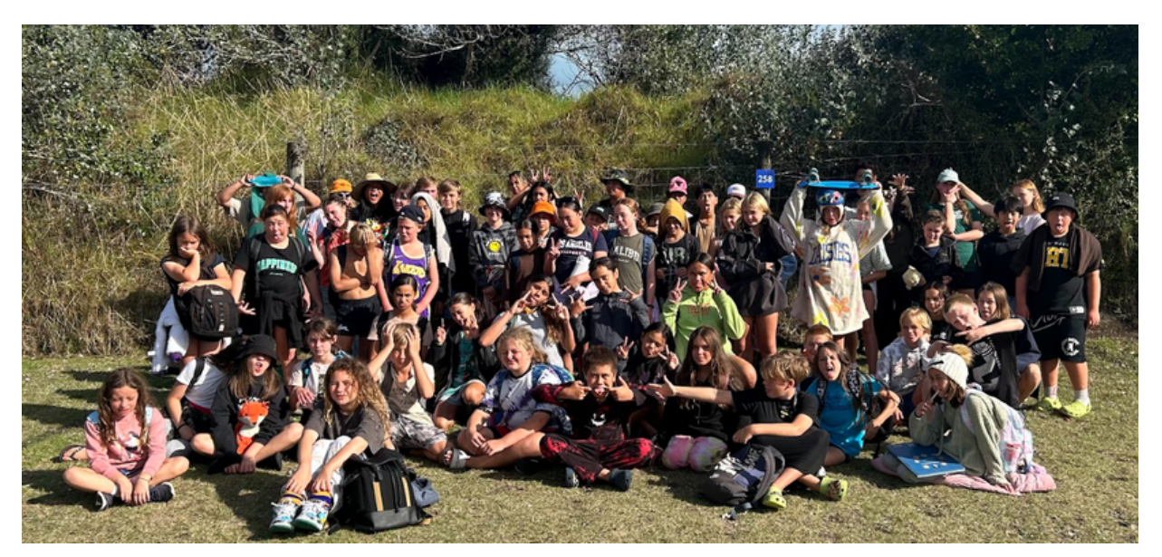
Here is a snippet of what the kids had to say:-