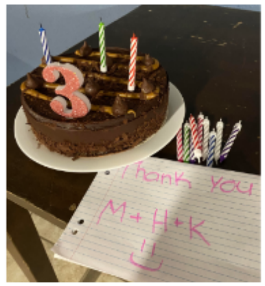
A lil surprise thank you cake from the students on the OE camp to the teachers....Made their day. Shot students!!