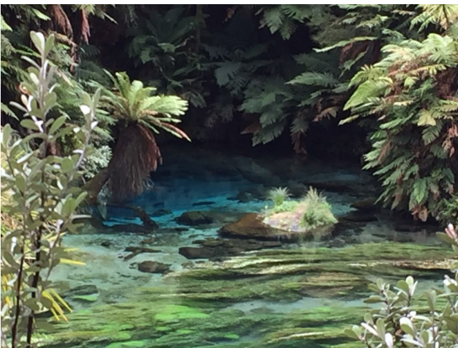
Below: Senior Winner in The Last Supper Challenge—12HMO